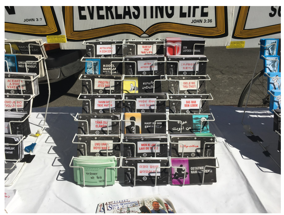
It's fun to hand someone a tract in their native language

That is the mission I have in my heart: to preach the gospel. I enjoy doing it. I love to do it. I believe to be unworthy, but God can use even the biggest fools in the world to serve him. I just love the Lord Jesus Christ so much, for saving my soul from hell. I could have died and gone to hell, but God had so much grace and mercy to save me from hellfire.