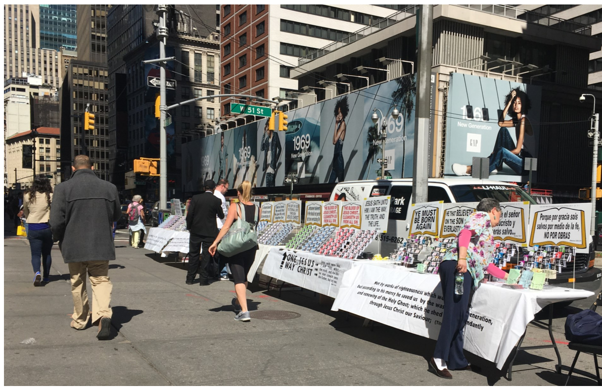
Times Square is big and grand, therefore we must be grand as well.