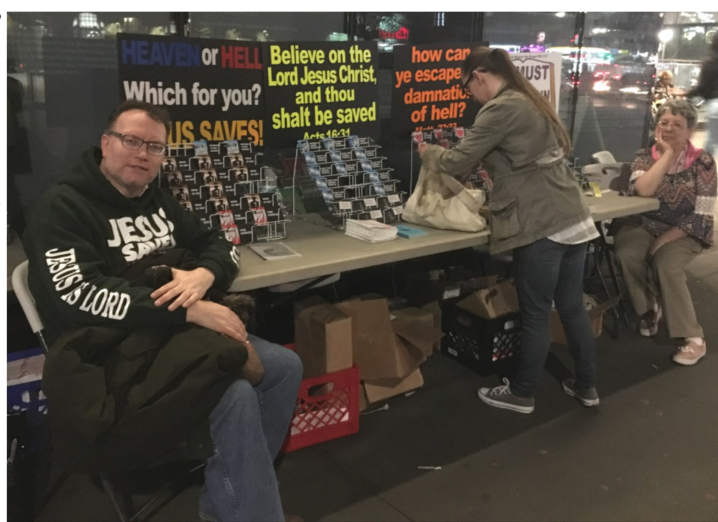
It was so warm today, we had to set up outside!

We don't ever want to believe our loved ones are going to hell, the thought of it feels dreadful. But if they are not saved, the truths remains unhinged; they will go to hell. Any man or woman who ponders about hell will eventually become insane. Often, I become delirious. My intention is not to make your heart weary, but to make you soulconscious. Hell is as real as the gorgeous green earth you and I live in. With these verses hidden