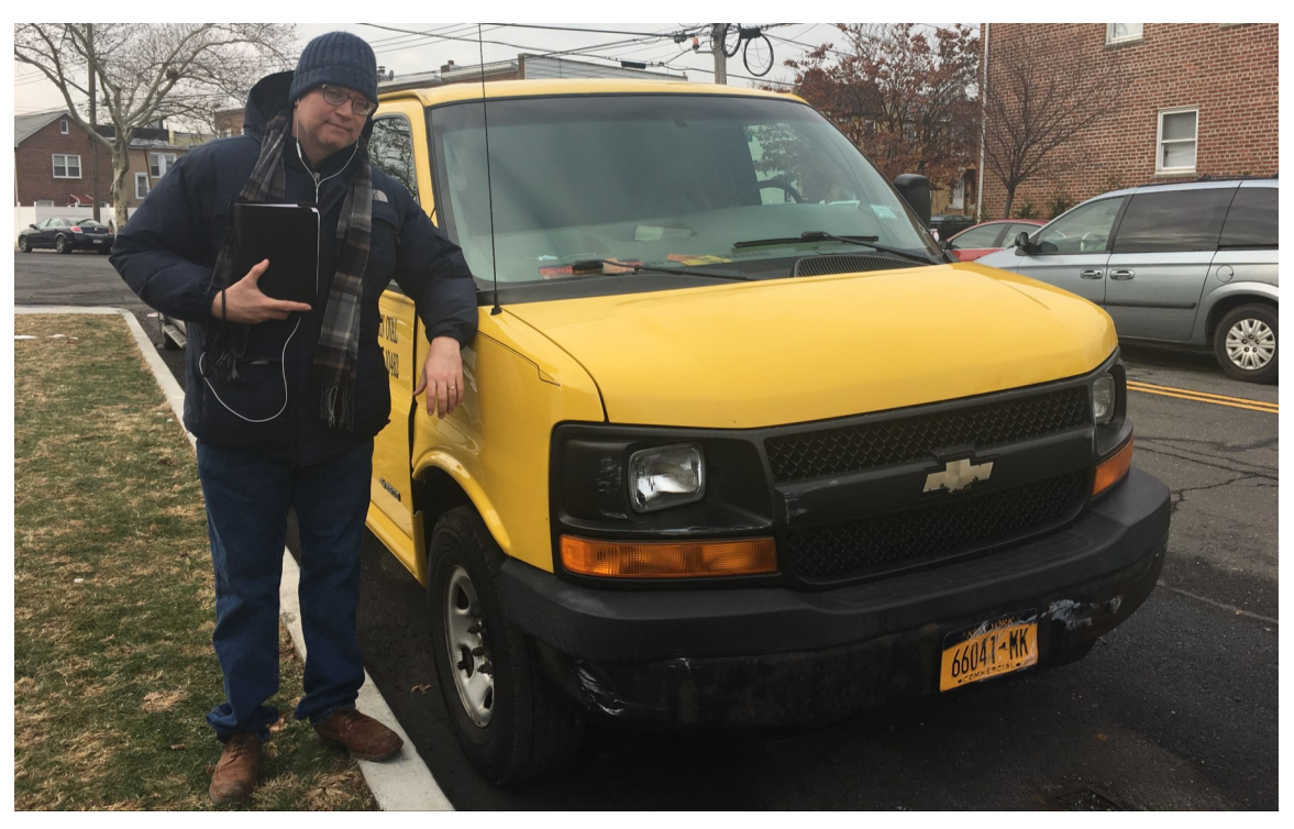
Our church van furthers the outreach of our ministry and is a blessing!