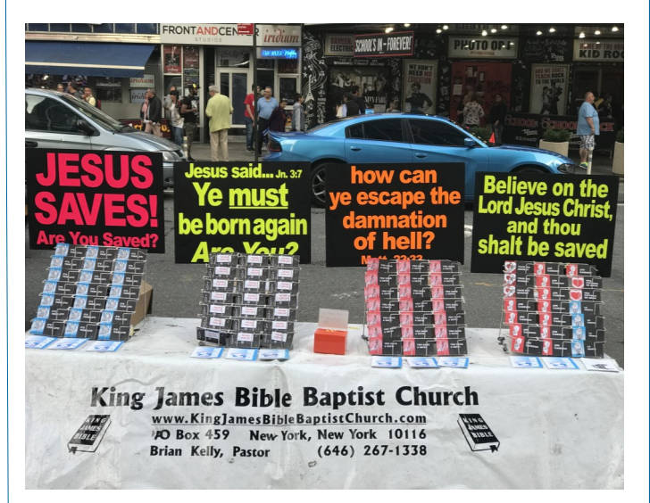
Colorful signs and plenty of tracts capture the eyes of many souls passing by.

Every tree that bringeth not forth good fruit is hewn down, and cast into the fire.