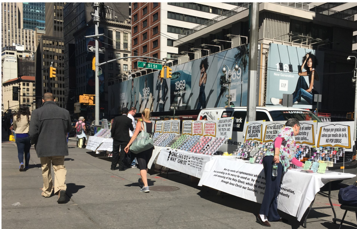
Times Square is big and grand, therefore we must be grand as well.