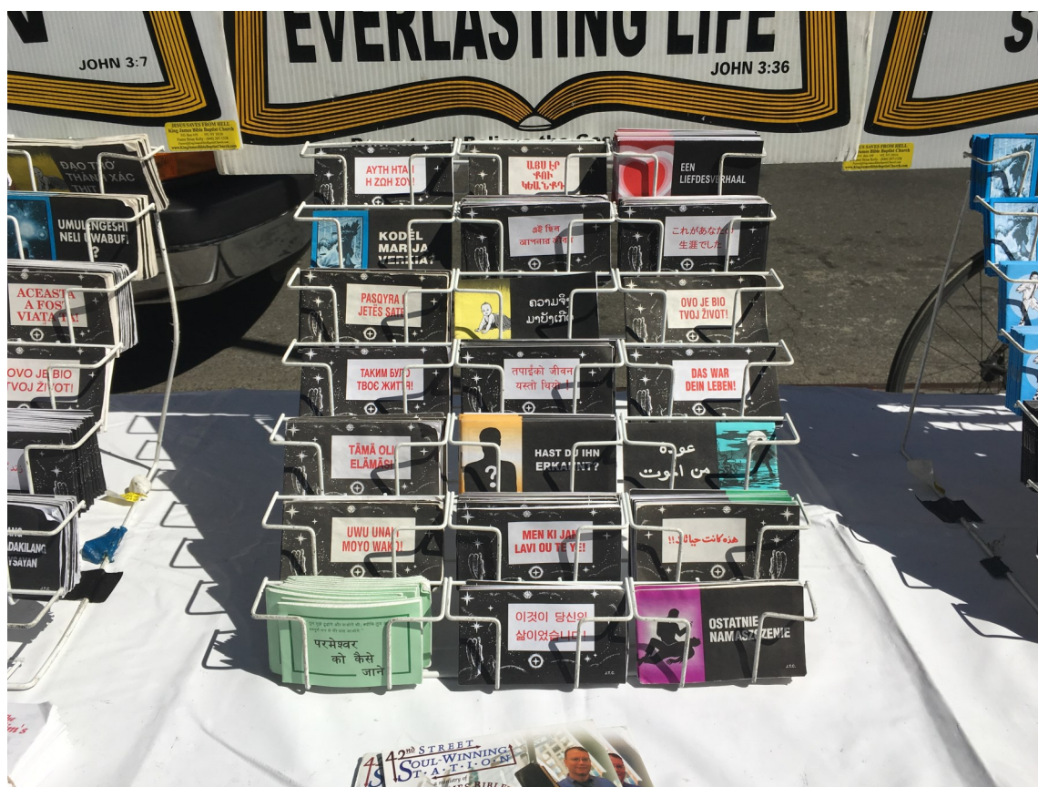
It's fun to hand someone a tract in their native language

That is the mission I have in my heart: to preach the gospel. I enjoy doing it. I love to do it. I believe to be unworthy, but God can use even the biggest fools in the world to serve him. I just love the Lord Jesus Christ so much, for saving my soul from hell. I could have died and gone to hell, but God had so much grace and mercy to save me from hellfire.