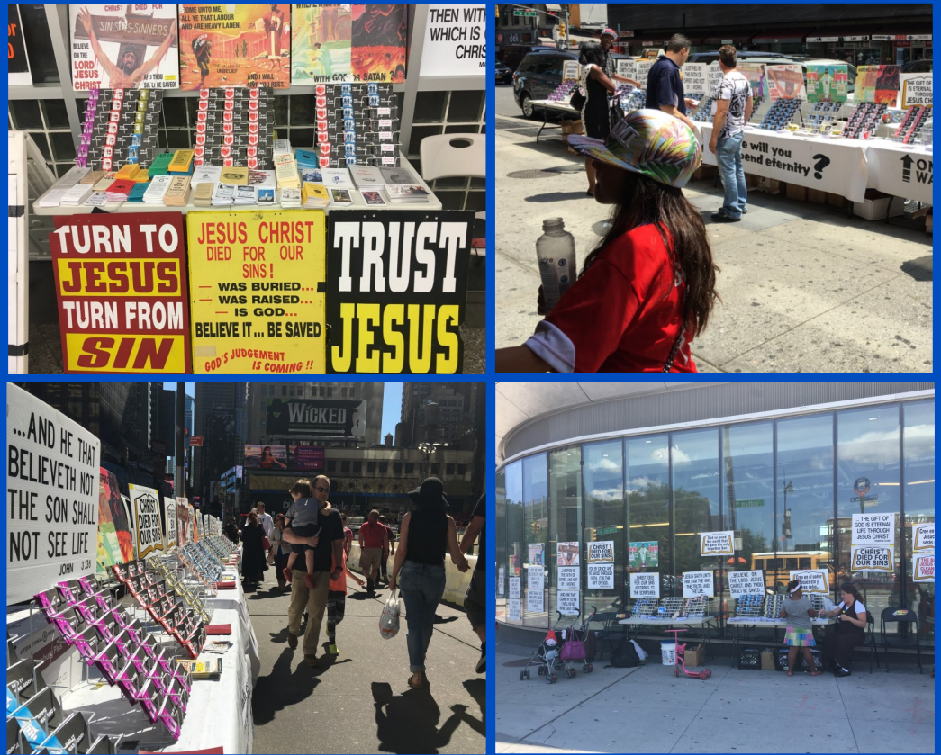
Many eternal lives have been saved through this facet of our ministry. Praise God!